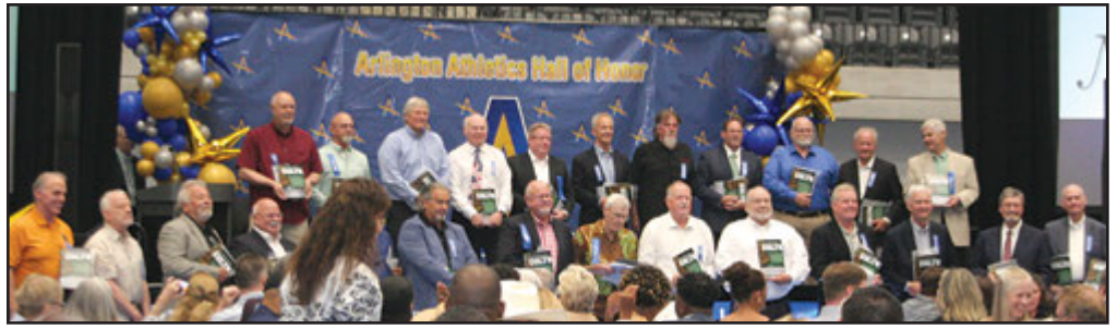
Members of the AHS Colt Football team classes of '70 and '71 were recognized with the 2024 Heritage Award at the annual Tom Vandergriff Night of Champions' Induction Ceremony and Awards program, sponsored by the Arlington Athletics Hall of Honor Foundation.

Thank you to those who nominated Alumni Colts for the Distinguished Colt Award honors. The committee is reviewing the nominations and will finalize this year's honorees within the next month.